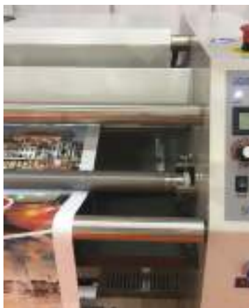
Liquid lamination machine