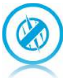
Scratch and abrasion resistance