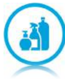
Water and chemical resistance