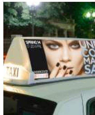
Economical liquid lamination on fleet graphics