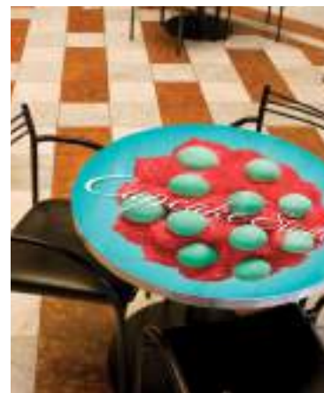
Water and chemical resistance