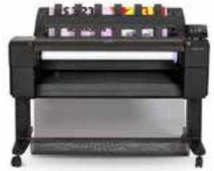
HP Designjet T920 ePrinter Innovative user experience. Print fast and collate jobs thanks to the output stacking tray. hp.com/go/DesignjetT920