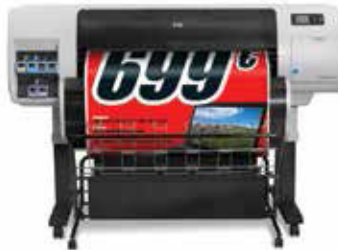
HP Designjet T7100 Printer Color production printer with three different rolls. hp.com/go/DesignjetT7100