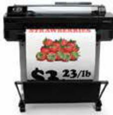
HP Designjet T520 ePrinter Two printers in one. Print using the built-in B+/A3 tray and front-loading media roll. hp.com/go/DesignjetT520

Tailor your message to customers in each and every store with fresh, relevant large-format promos and displays delivered on demand. HP Designjet Printers - for signage that speaks to customers in a big way.