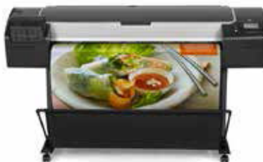
HP Designjet Z5400 PostScript® ePrinter Enjoy the convenience of two media rolls for producing long-lasting indoor signage. hp.com/go/DesignjetZ5400