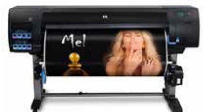
HP Designjet Z6200 Photo Printer The fastest production printer for graphics with unrivaled print quality. hp.com/go/DesignjetZ6200