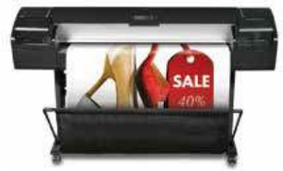
HP Designjet Z5200 Photo Printer Instant large-format printing of long-lasting, high-quality prints. hp.com/go/DesignjetZ5200