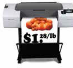
HP Designjet T790 ePrinter Easy-to-use printer that can grow with your business. hp.com/go/DesignjetT790