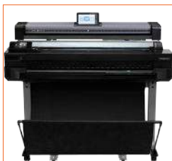
Optional high stand to place over printer.