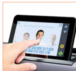
Browse user profiles on the SD One MF and scan direct to preset destinations unique to each user.