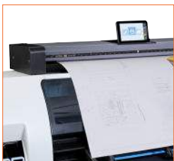
SD One MF is light enough to be placed on any flat surface like a printer.

Perfect for situations where you need to allocate costs, SD One MF has integrated print management software, allowing you to track the cost of every scan, copy or print.