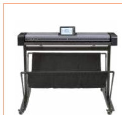
Low stand for side-by-side