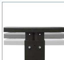
Height adjustable stand for optimal ergonomics

Est. 1991 DESIGNSUPPLY supporting creativity