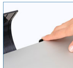
Easily adjust paper pressure to protect fragile documents