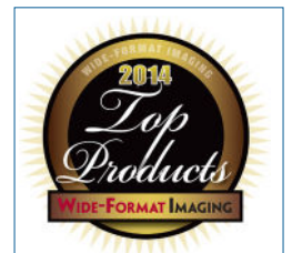
Contex HD Ultra awarded Best Wide Format Scanner for third consecutive year