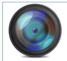
Contex CCD with ALE ensures precision of 0.1% accuracy

HD Ultra scanners are for customers who require a high throughput of documents, great flexibility and unmatched performance.