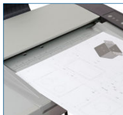
Support your documents with paper feed guides