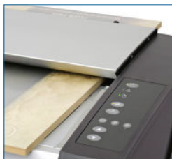
Scan thick originals with automatic thickness control (ATAC)