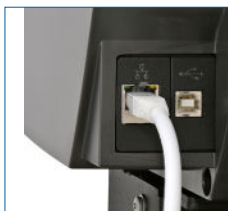
Fastest bandwidth in the industry w/ Gb Ethernet and xDTR2