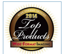
Contex HD Ultra awarded Best Wide Format Scanner for third consecutive year