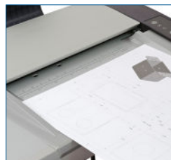
Support your documents with paper feed guides